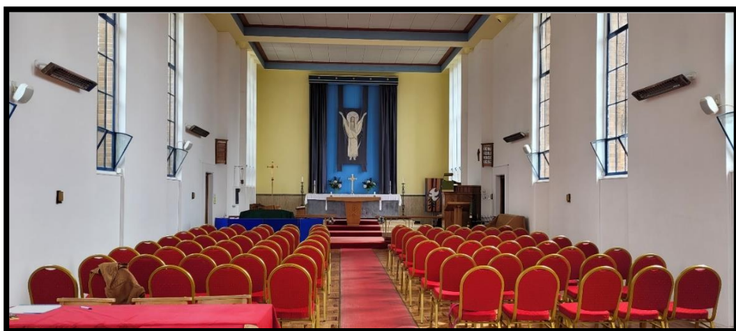
New Chairs - August 2022