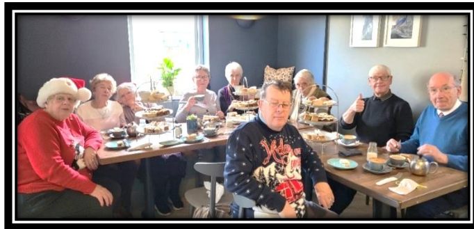
Christmas afternoon tea at the Bluebell Café - December 2022