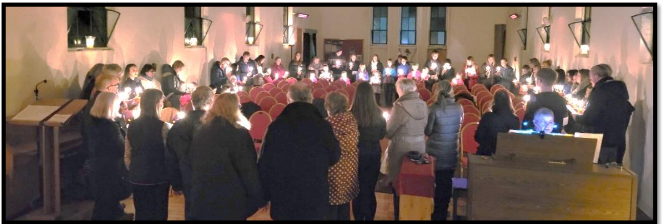
Christingle Service – Friday 16 December 2022